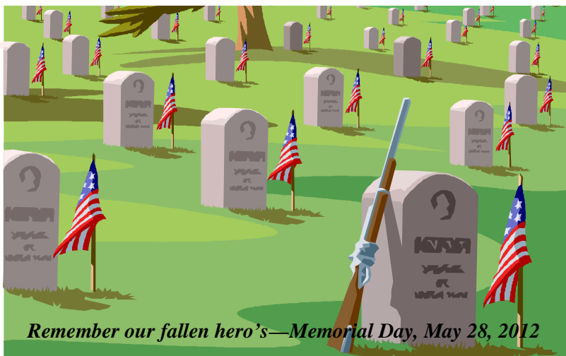
Remember our fallen hero's—Memorial Day, May 28, 2012

Call or come up to the Lodge to sign up, or email salisburyelks699@gmail.com